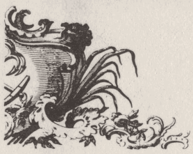
Vie des bords de la Neva en remontant la riviere entre l'Amirauté et les batimens de l'Academie des Sciences.